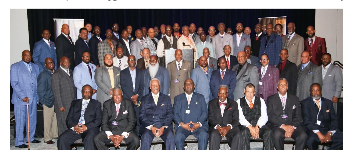
April 20-25, 2019 - St. Louis, Missouri